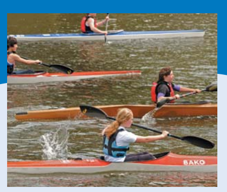
Festival events organised by Twickenham Alive